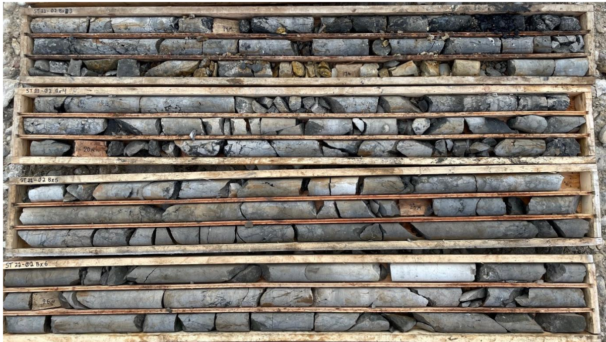
Figure 5: Drill core from ST22-02 between 13.6 – 27.3m downhole showing massive and breccia chalcocite (dark grey) hosted within dolomite (pale grey)