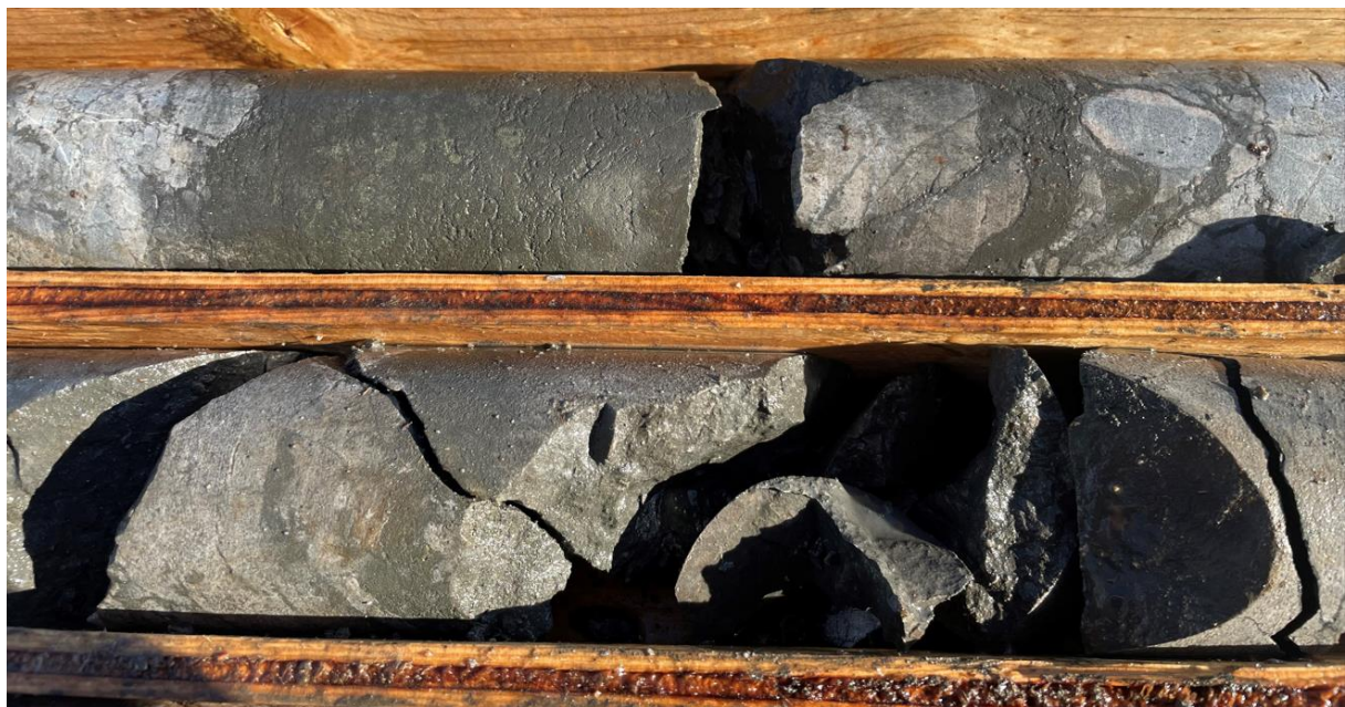
Figure 1: Massive and breccia chalcocite (dark grey) from approximately 36m downhole in drill hole ST22-01.