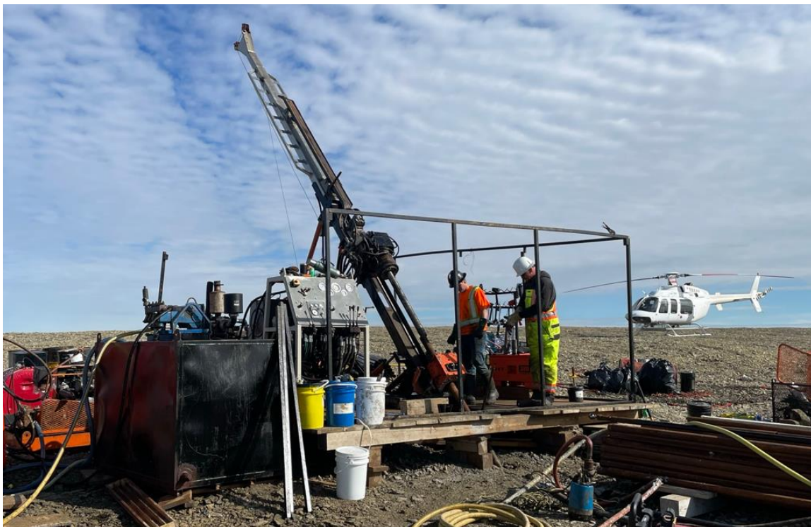
Figure 2: Drilling underway on drill hole ST22-01 at the 2750N Zone, Storm Copper Project

"The onsite team is doing a fantastic job executing this important drill program, and we look forward to reporting more news as drilling progresses."