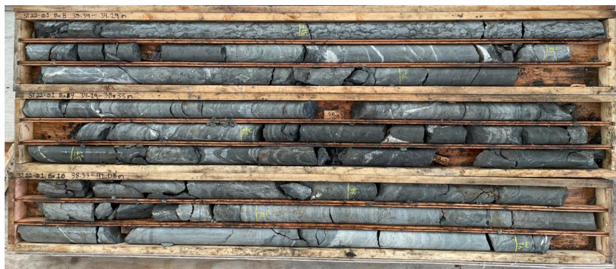
Figure 4: Drill core from ST22-01 between 30.34 – 42.08m downhole showing massive and breccia chalcocite (dark grey) hosted within dolomite (pale grey)

Table 1 summarises the mineralisation as observed in ST22-01. Intersections are expressed as downhole widths and are interpreted to be close to true widths. Visual estimates of sulphide quantity and habit should not be considered a substitute for laboratory assays. Laboratory assays are required to determine the widths and grade of mineralisation as reported in preliminary geological logging.