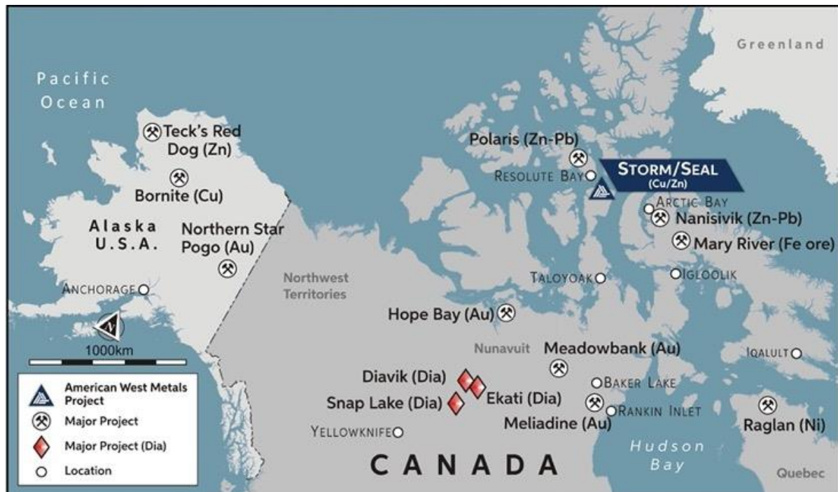
Figure 6: Location map of major northern Canada and USA mining projects

American West Metals Limited has an option to earn an 80% interest in the Storm Project.