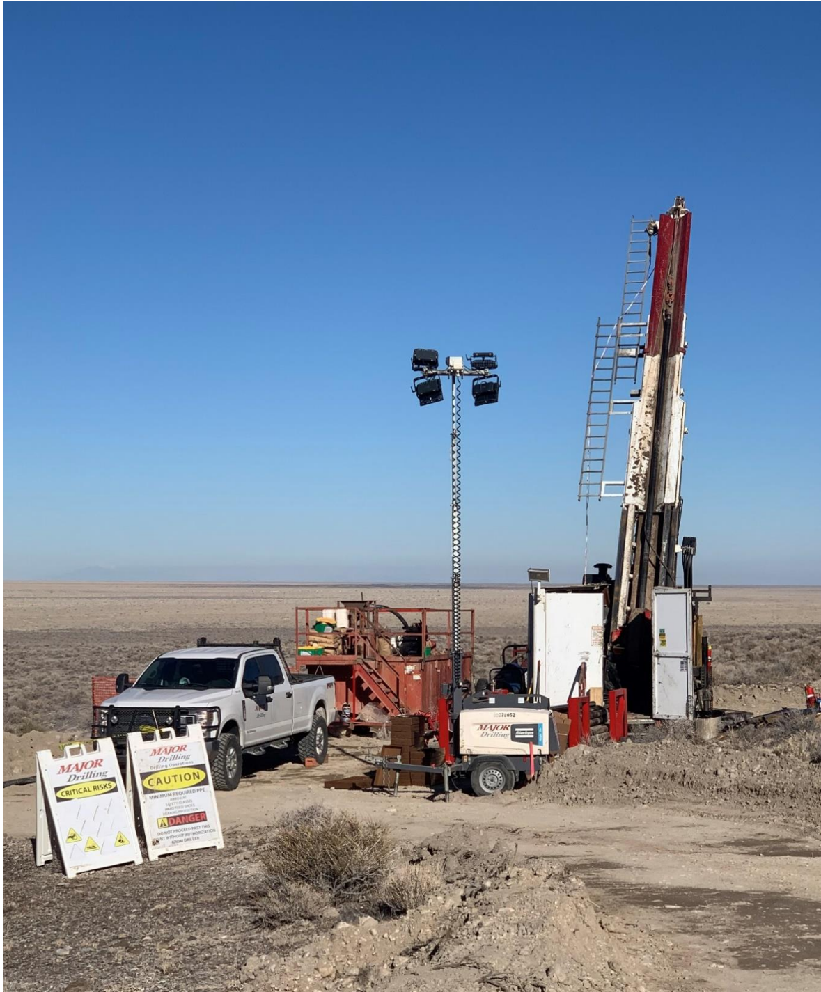
Figure 3: Major Drilling Group International Inc. drill rig and support equipment located on drill hole WD22-01.