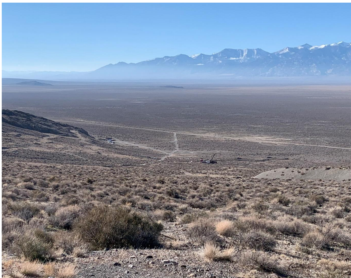
Figure 1: Drill hole WD22-01 underway at the West Desert Project. The photo was taken looking SW towards Snake Valley and the Deep Creek Range, with the drill rig and laydown area visible in the centre of the photo.